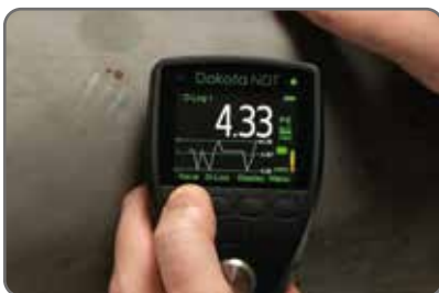
Set user definable limits for audible and visual pass/fail warnings