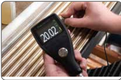
Coatings up to 2mm (80mils) can be ignored