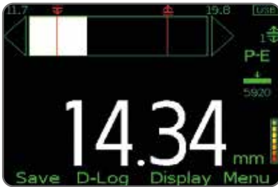
Customisable reading display