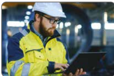
Connect the gauge via Bluetooth® or USB to PC