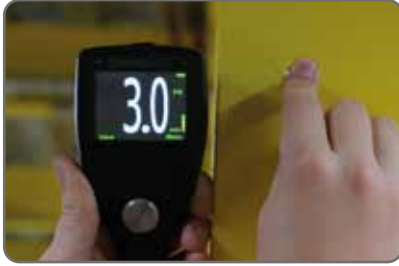
Easy to use with minimum set up

The CX gauges have a range of calibration options including the 1-Point calibration method. Users can also select one of 39 pre-set materials stored within the gauge or store up to three calibrations into the memory.