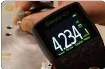
Up to 100,000 readings can be saved into the gauge memory

Up to 100,000 readings can be saved into the gauge memory as each measurement is taken, which can be downloaded later into an inspection application or into DakMaster® Software for further analysis and reporting.