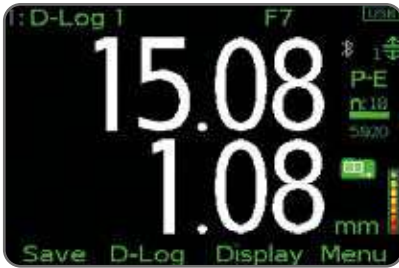
Customisable reading display