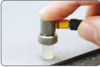
\pm 1\% accuracy across three measurement modes

Flexible & easy to use, the Dakota PCX gauges have a measurement range from 0.15mm (0.006") to 25.40mm (1.000") with up to \pm 1\% accuracy, across three measurement modes; Interface Echo (IE), Echo Echo (EE) & Plastic mode (PLAS).